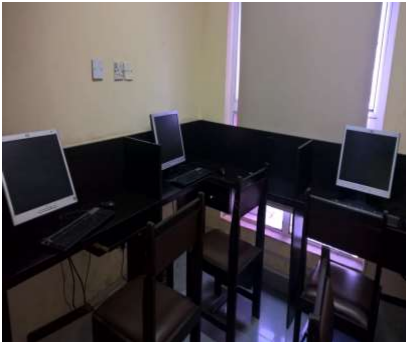
Current CBE Center