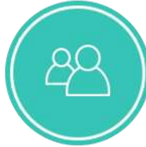
Flexible learning options