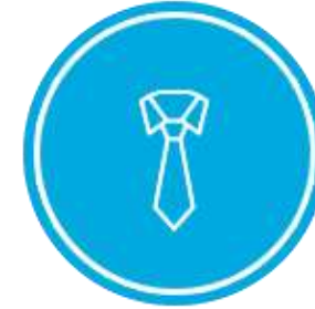
Student advise center

TNSS has been approved as the exclusive teaching institution for the MSc in professional Accountancy from University of London. We now have the responsibility of providing tuition support to ACCA students in Nigeria who are interested in earning this internationally recognized degree, by providing;